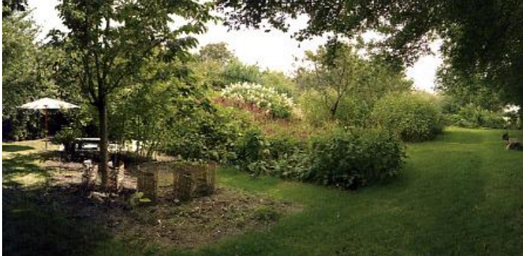
Les Hautes Haies

(If you like small gardens, also take a look at St Paul le Gaultier (half-way between St Leonard and St Germain) and visit “ Les Hautes Haies ” (a rich collection of polygonums), and walk around the village and its large pond, see the hedge with a hundred different varieties of honeysuckle !)