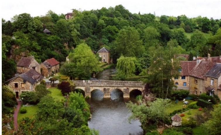
The village of St Céneri-le-Gérei

Repertoried as one of the most beautiful villages in France. A rendez-vous for artists since the XIXth century.