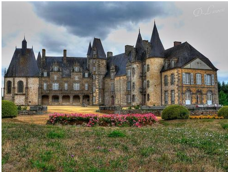
Chateau du Rocher

A little further, in Mezangers, take a stroll on the impressive grounds of the Chateau du Rocher (The chateau itself is not open to the public).